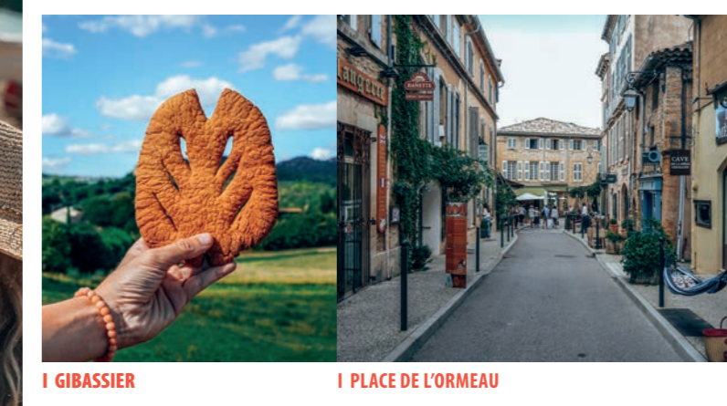
I GIBASSIER I PLACE DE L'ORMEAU