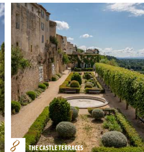
8 THE CASTLE TERRACES