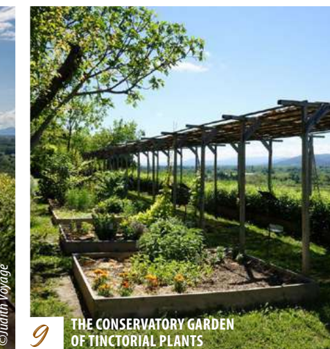
9 THE CONSERVATORY GARDEN OF TINCTORIAL PLANTS