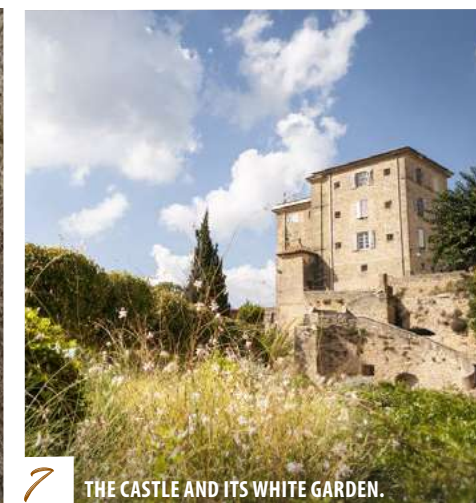
7 THE CASTLE AND ITS WHITE GARDEN.