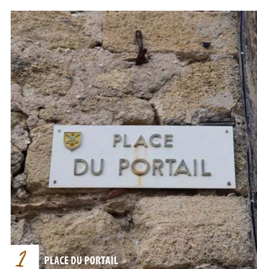
1 PLACE DU PORTAIL