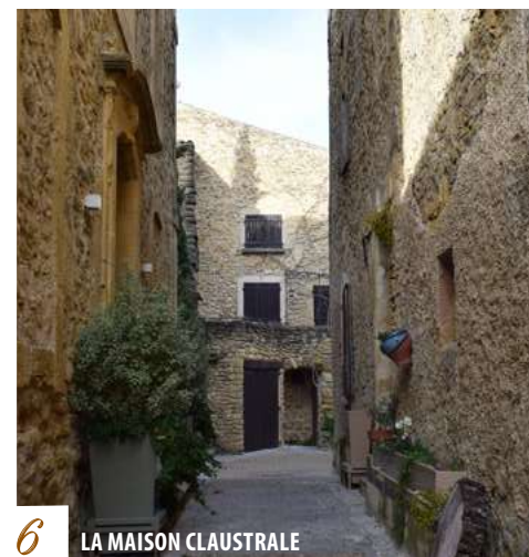
6 LA MAISON CLAUSTRALE