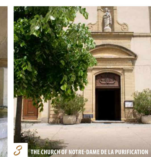
3 THE CHURCH OF NOTRE-DAME DE LA PURIFICATION