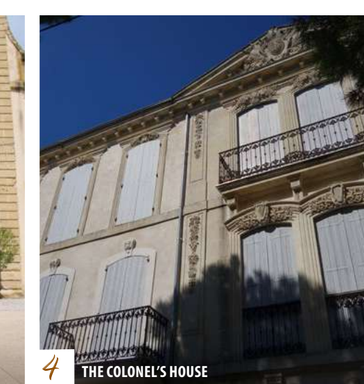
4 THE COLONEL'S HOUSE