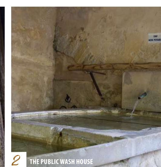
2 THE PUBLIC WASH HOUSE